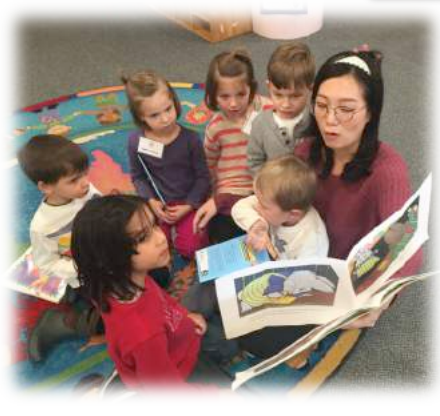
We are so happy to be back together again! We love reading stories as a group.