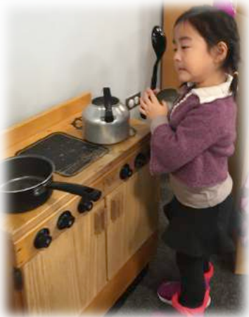
Dramatic play encourages students to actively experiment with the social and emotional roles of life. We loved pretending to work at a hot cocoa stand. Yubin makes the hot cocoa, while Linneae and Brigetta sell the yummy treat to Isha.