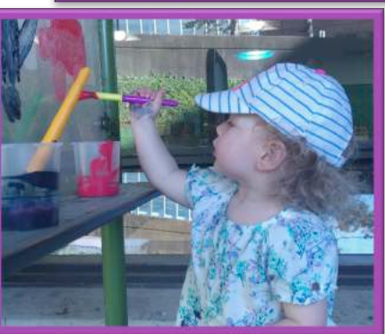
Try this at Home