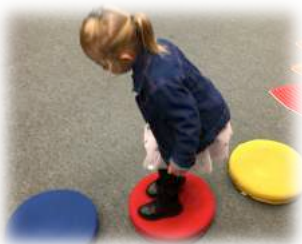
Rosaria jumps from circle to circle with both feet!

Our students have been loving the sensory experience of playing in shaving cream. Shaving cream is easy to play with at home! Put some on a table, cookie tray, or even in the bathroom and encourage your child to draw or write in it. If your child doesn't like to get messy, give them a q-tip to write with instead like Linneae!