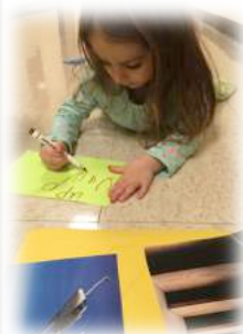
Isabella practices letter knowledge and writing as she writes the word 'up.'