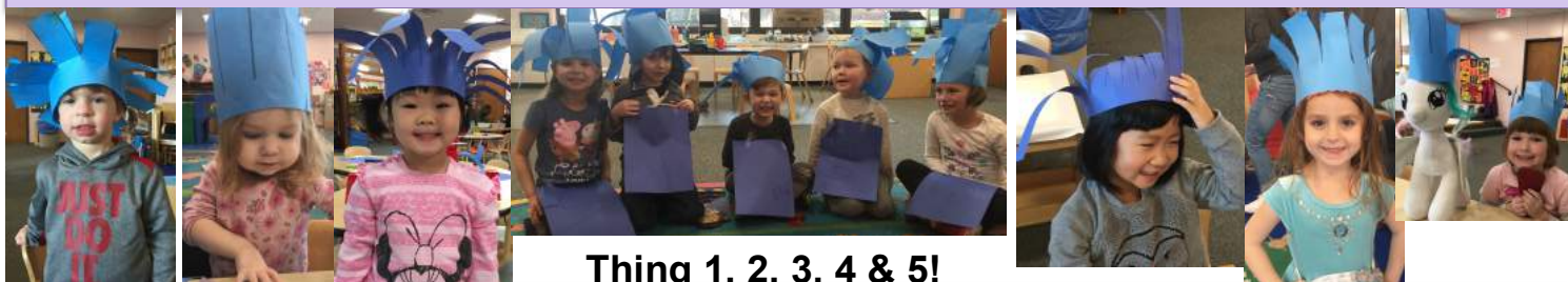
Thing 1, 2, 3, 4 & 5!

In addition, we all have newfound love for Dr. Seuss and his characters. We brought to life some of his most beloved characters, such as the Cat in the Hat and Thing 1 & Thing 2. We even had to get creative and make more Things so that everyone could join in the fun!