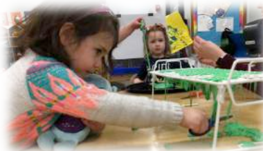
Verona cuts the dripping slime!