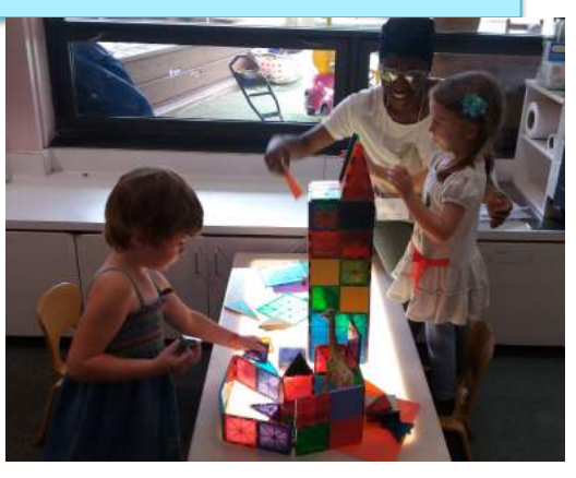
Then, the girls work together to build their castle!